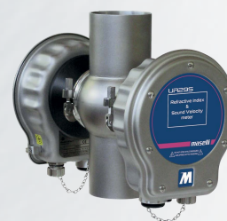
In line - Alcohol, Plato, Extract, CO 2