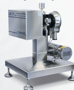
In Line - Bx / Diet / CO 2