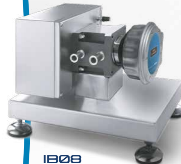
IB08 Brix-Diet CO 2 IR