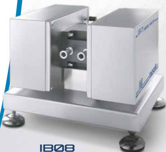
IB08 Brix-Diet CO 2 P/T