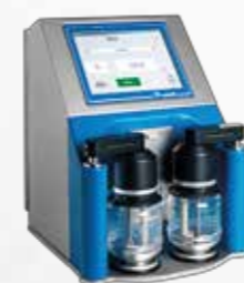
Laboratory - Diet Soft Drinks