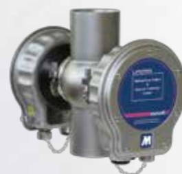
In line - Alcohol, Plato, Extract, CO 2