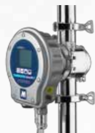
Syrup Room - Sugar Dissolution